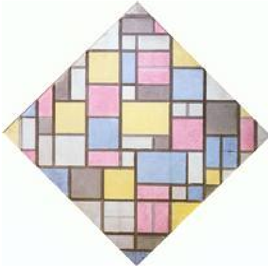
Composition with Grid VII 1919