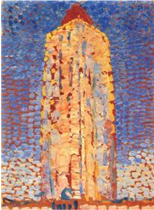
Lighthouse in Westkapelle 1909