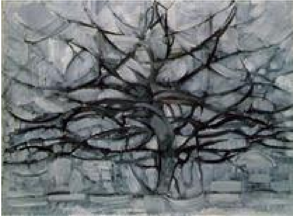
The Gray Tree 1911