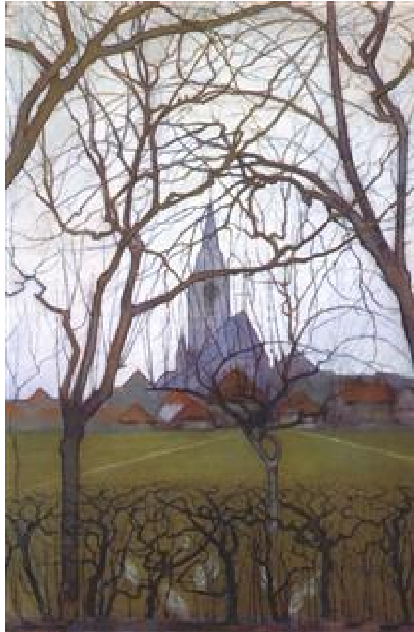
Village Church 1898